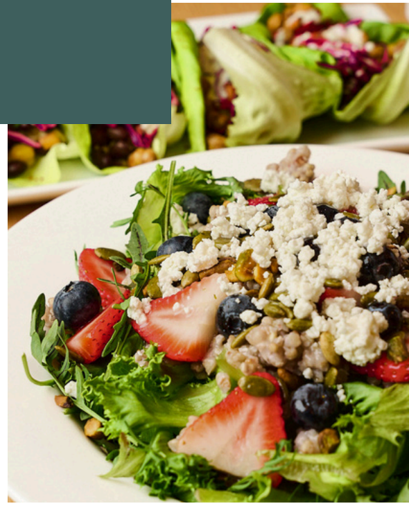
Berry Grain Bowl

Balsamic Vinaigrette V Ranch Raspberry Vinaigrette V Caesar Italian V