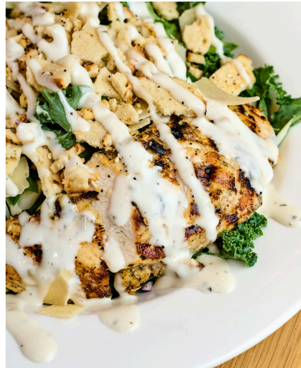
Everything Crunch Bowl

CONTAINS GLUTEN CG VEGETARIAN OPTIONS VG VEGAN OPTIONS V