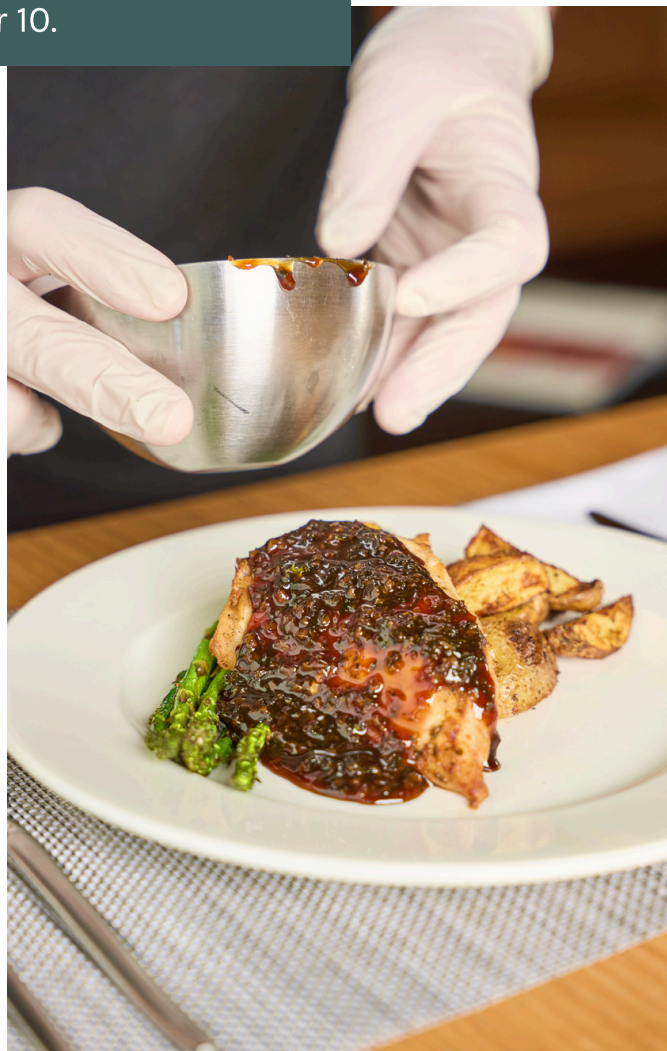
CONTAINS GLUTEN CG Vietnamese Glazed Chicken VEGETARIAN OPTIONS VG VEGAN OPTIONS V

Mixed greens, gorgonzola cheese, dried cherries, candied pecans, and raspberry vinaigrette