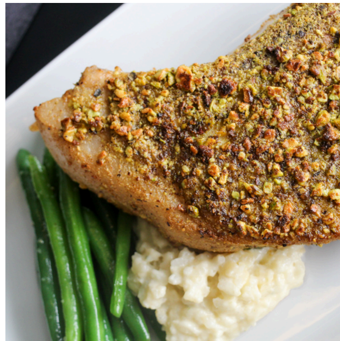
Pistachio Pork Chop