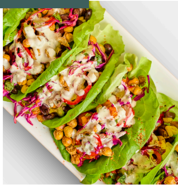
Summer Lettuce Wraps

Choice of spinach and artichoke VG , or buffalo chicken. Served with tortilla chips 60