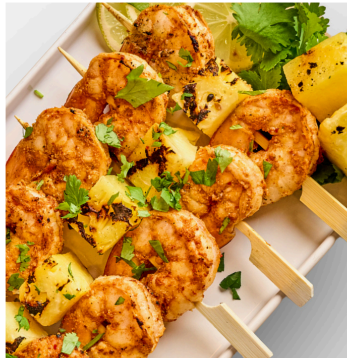
Columbian Shrimp Skewers