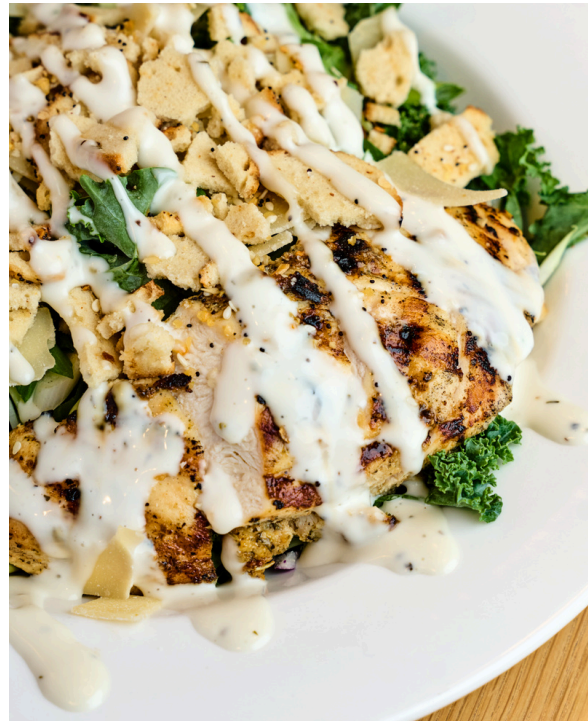
Everything Crunch Bowl

CONTAINS GLUTEN CG VEGETARIAN OPTIONS VG VEGAN OPTIONS V