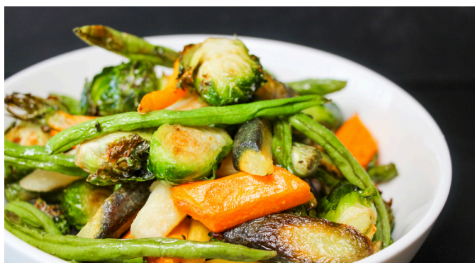
Signature Vegetable Blend

Balsamic Vinaigrette V Ranch Raspberry Vinaigrette V Caesar Italian V