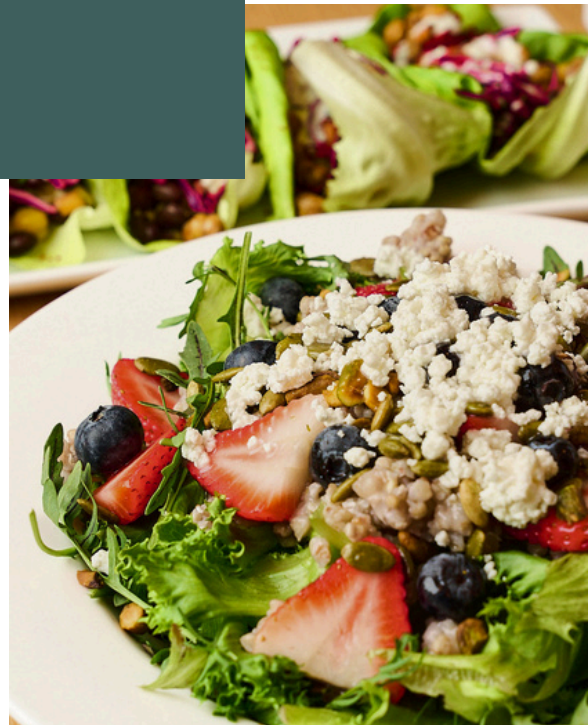
Berry Grain Bowl

Balsamic Vinaigrette V Ranch Raspberry Vinaigrette V Caesar Italian V